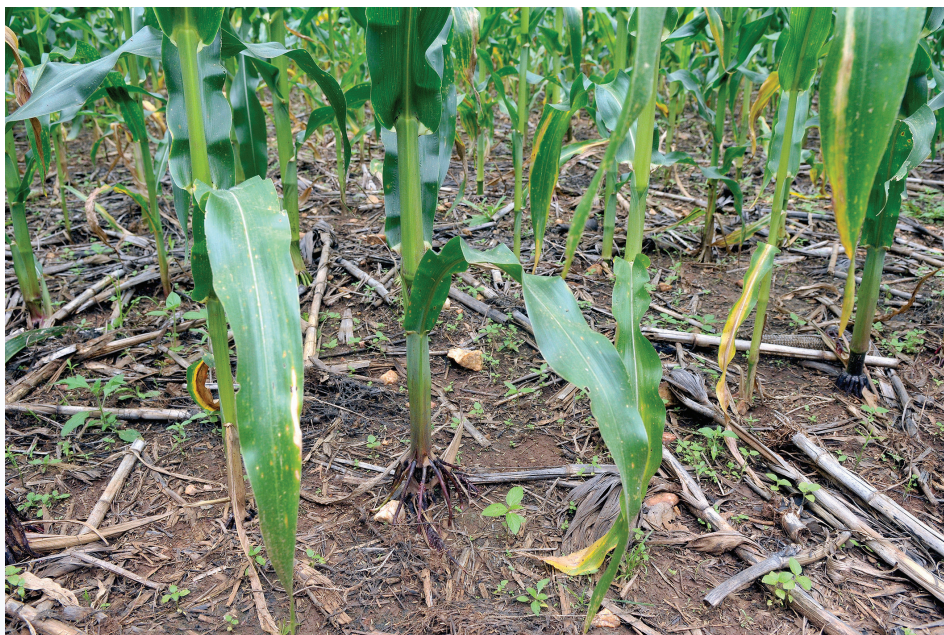
Maize under conservation agriculture (CA), with residues of the previous crop, in Malawi.

Contact: Menale Kassie - m.kassie@cgiar.org