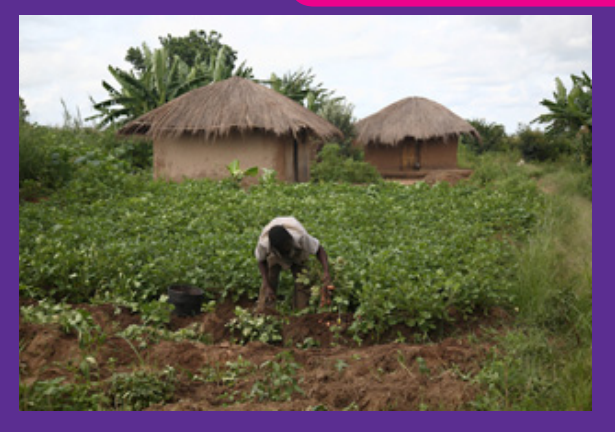
Fig 3. A Malawian farmer in his farm

The Maize Mixed Farming System occurs on sub-humid highland and plateaux areas from 800 to 1500m elevation, with a medium season length (191 days average), and has a higher population of rural poor than any other farming system in Africa. Area expansion has underpinned most previous growth in food production in the system. However, this has now reached limits, with agricultural margins pushed into remaining forests. Hunger and poverty are extensive (80% of the poor depend on farming for their main livelihood). Some diversification and intensification has occurred, showing that it is feasible in this system. Off-farm work is a significant contributor to income in most households. The development of road networks in the past few decades has given most of the rural population in this system moderate or good access to input and produce markets. However, a less supportive policy and trade environment relative to the Highland Perennial farming system has made it difficult for smallholder farmers to access seeds, inputs and output markets in order to respond to market price signals. The system has the potential to be the food basket and a driver of agricultural growth and food security in the region.