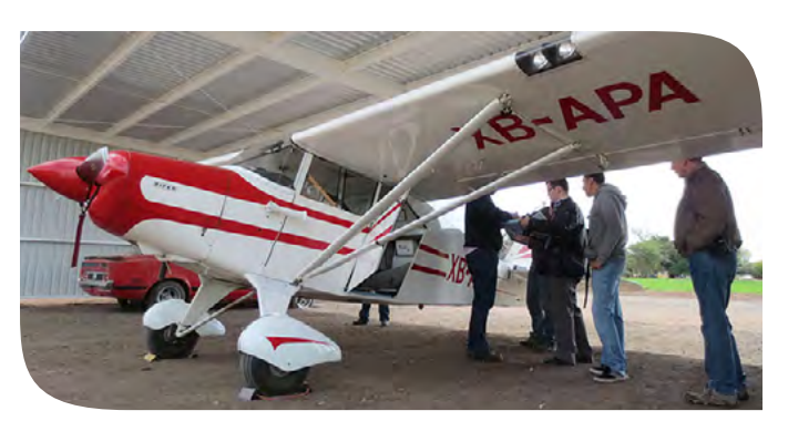
The aircraft operated near CIMMYT station in Ciudad Obregon ready for hyperspectral imagery collection.

This makes it possible to calculate several new spectral indices related to photosynthetic pigments, such as chlorophyll content, carotenoids, xanthophylls, and anthocyanins, as well as measure physiological and structural indicators, which can be used to map nitrogen status and derive nitrogen recommendations to improve wheat quality. Most importantly, the new hyperspectral