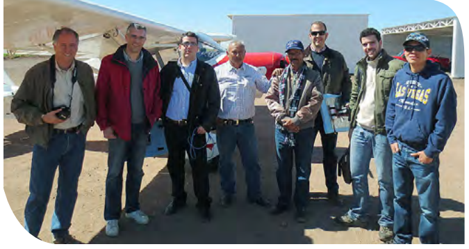
Members of CIMMYT (Ciudad Obregon), IAS-CSIC (Spain) and the aircraft crew during the flight tests conducted to test the new hyperspectral camera.